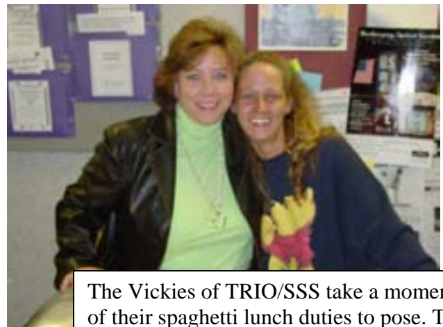
The Vickies of TRIO/SSS take a moment out of their spaghetti lunch duties to pose. Thanks for all your hard work Vickie and Vickie!