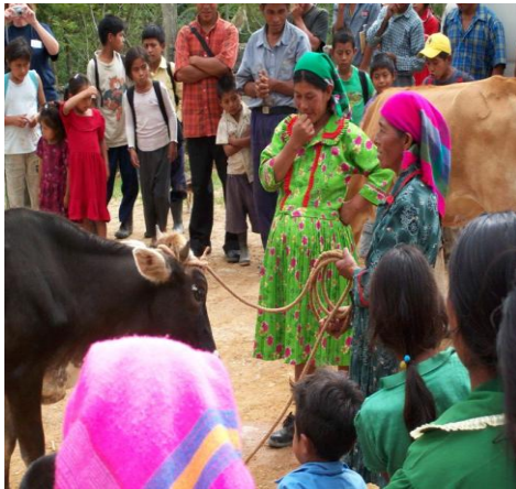
“Passing on the gift” through Heifer Honduras