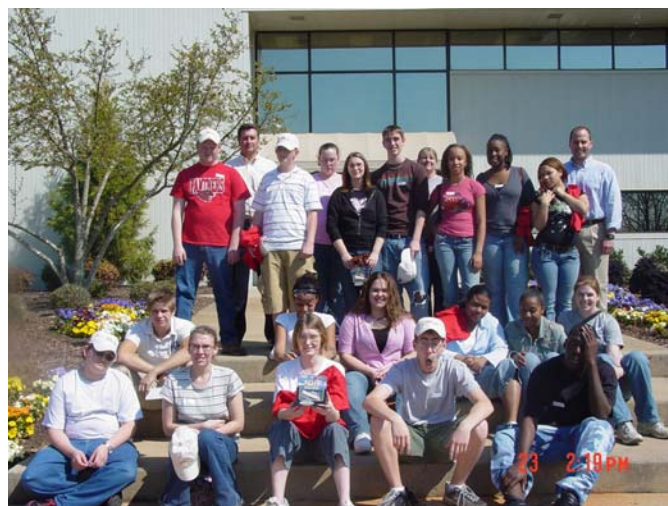
TRIO/ETS students outside at Curtiss-Wright Corporation