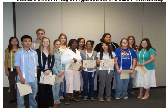
Hibriten seniors present at the breakfast