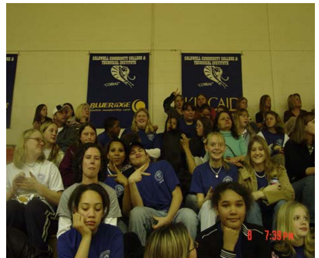
TRIO/ETS students, friends, and family at the Cobra Pit!!

On February 8, 2007, TRIO/ETS students attended the CCC&TI vs. CVCC basketball game. The basketball game was fun because you could sit anywhere you wanted to on our side to support our team. You could bring someone if you wanted to, and it was no charge. At halftime you could go outside the gym and purchase food and drinks, and if you ran out of money you could go back to the TRIO/ETS office and get a snack. We were also able to have a badge made with our name and picture on it. We were able to sit with our friends and family while enjoying the game, and that's what made it fun and exciting.