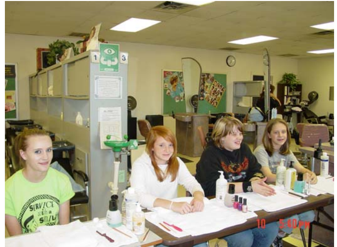
TRIO/ETS students prepare for their manicures

we would have to go to college for a certificate, diploma, or associate degree. Then we got to see a little of what the students do. We went into the salon, and the cosmetology students gave us complete manicures. It left our hands feeling refreshed and new. Also, they washed and styled our hair. This trip was very exciting and helpful. I won't forget it.