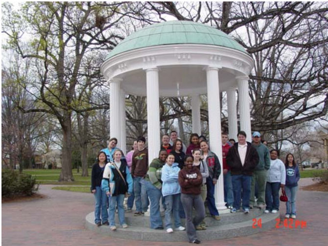
TRIO/ETS students at UNC Chapel Hill