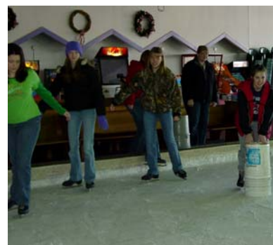
On February 18, 2005 TRIO/ETS students who made A Honor Roll for Fall Semester 2004 went on a reward trip to Ice Castle in Newton, NC.

The Ice Castle will soon move to a new location in Hickory. The new rink is going to be a lot larger than their current rink. The rink should be open by the middle of the summer.