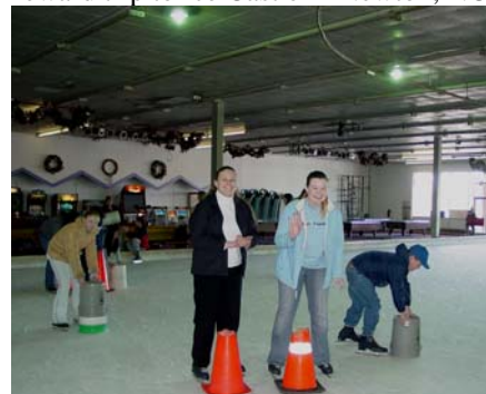
This trip was made possible through private funds given by the Beaver Family Foundation.