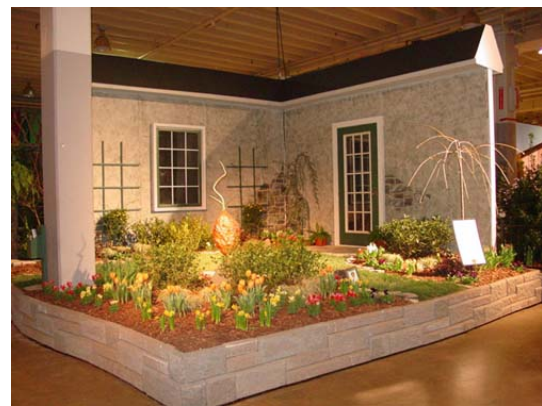
Exhibit from 2004 Garden Show

The Southern Spring Home and Garden Show is the largest garden, indoor and outdoor living show in the South, occupying 220,000 square feet of space at the Charlotte Merchandise Mart. The show begins March 2 and will last until March 6. The show is broken into eight categories which include: the Interiors Showplace, Taste and Travel, the Kitchen and Bath Pavilion, Building and Home Improvement, Decorative Arts and Crafts, the Garden Showplace, the Green Marketplace and an Outdoor Living Marketplace. CCC&TI's garden will be featured in the Garden Showplace category.