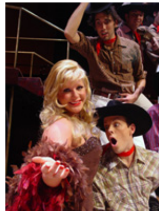
Join in on some Chicken Ranch Hootinanny

Don't miss this opportunity to witness this naughty and heartwarming musical. Tickets for Platinum seating are $35.50 ($32.50 for subscribers) and Gold seating tickets are $32.50 ($28.50 for subscribers). To purchase tickets, contact the J.E. Broyhill Center box office at 828.726.2407. Visa, MasterCard and Discover are accepted. Tickets may also be purchased online at www.broyhillcenter.com .