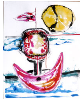
A Palomaki ink on paper