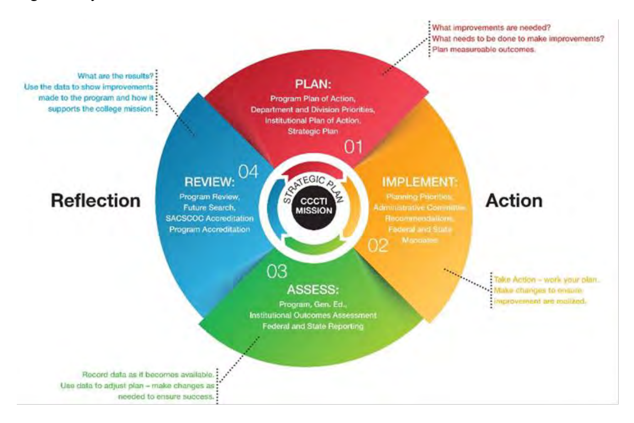
Figure 1: Cycle of Institutional Effectiveness

The entire IE cycle at CCC&TI, as illustrated in Figure 1 below, demonstrates a logical progression of planning and assessment for continuous quality improvement that supports the mission of the college. Faculty and staff are involved in all stages of the IE process, which is designed to build institutional planning and assessment up from the program, department, and divisional levels. CCC&TI's IE process ensures that the college is engaged in ongoing and integrated planning and evaluation for continuous improvement as depicted in the Figure 1: Cycle of Institutional Effectiveness.