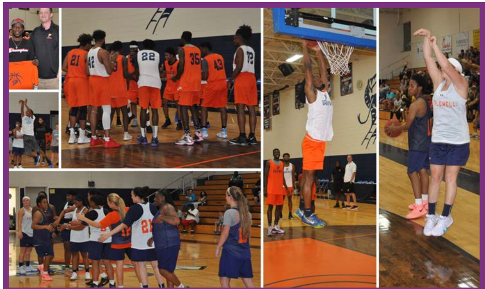
Above, some of the highlights from Cobra Fan Fest 2018. Players participated in a 3 Point Shootout, Dunking Contest and scrimmages for friends, family and fans.