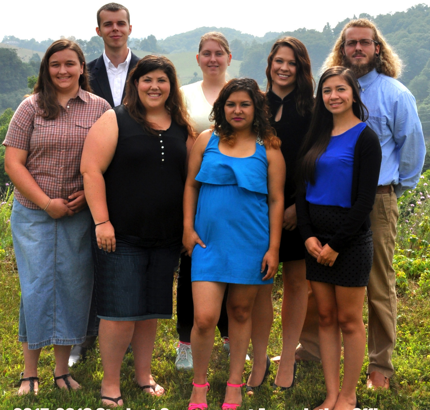
2015-2016 Student Government Association Officers