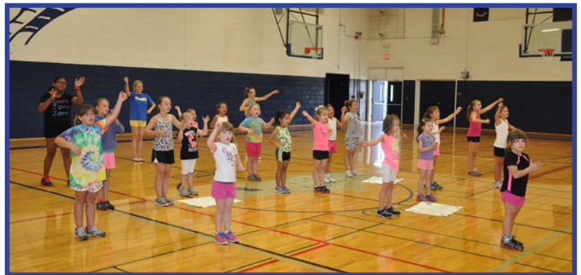
Above, A group of kids learn a cheer during the 2013 SuperSummer Cheer Camp at CCC&TI.

Spanish Fiesta: Intermediate featuring Language: The Next Step and Cultural Creations: Holidays