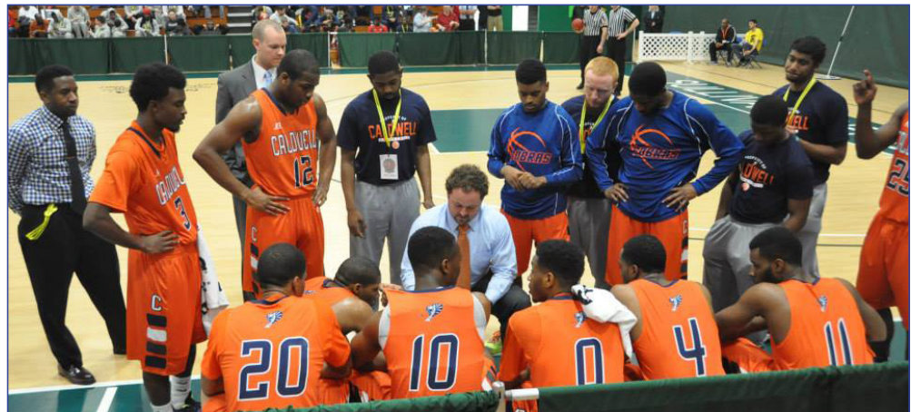
Above: The Cobras talk strategy during a time out.