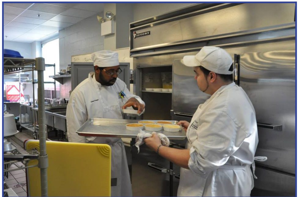
Two students in Caldwell Community College and Technical Institute's Culinary Arts program prepare crème brulee, which is on the menu for the February 20 Caldwell Cuisine event.